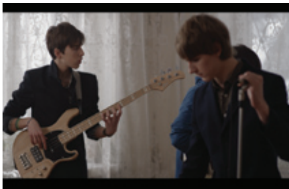
Deimantas Narkevičius, Ausgeträumt

Narkevičius is one of the most consistent and widely recognised Lithuanian artists on the international art scene. He represented Lithuania at the 49th Venice Biennale in 2001 and exhibited at the 50th Venice Biennale in 2003 with Utopia Station .