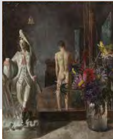
Patrick Hennessy, In the Studio , 1944, Private Collection