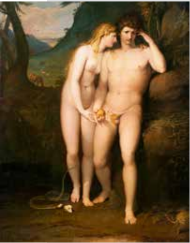
James Barry, The Temptation of Adam, 1767-1770